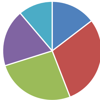
Sports Premium Spending Distribution